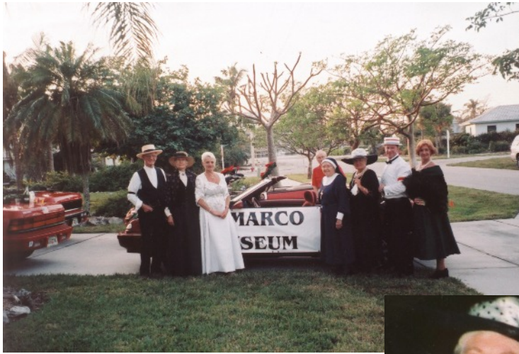
Christmas Parade 2005