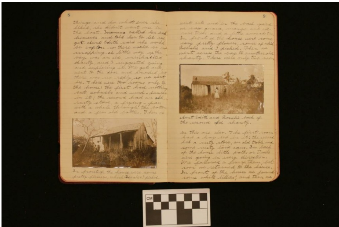
Original Olds Family Diaries