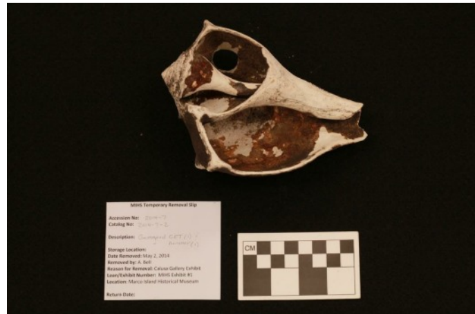
Gastropod Cutting-edged Tool