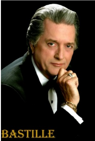
Bastille the Mentalist December 4th

PS If seats are available we will have tickets at the door the night of the event.