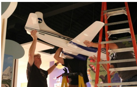
Installing the Marco Island Airways plane

So, in closing, I wish to personally thank you for all you have done as a member to make 2015 a memorable and important year in the history of the MIHS and Marco Island Historical Museum. I am so proud of what we've accomplished together and hope that the museum staff 50 years from now will look back at 2015 as a fundamental year in their organization's history. I'm sending my very best wishes to you and yours for a happy and healthy holiday season.