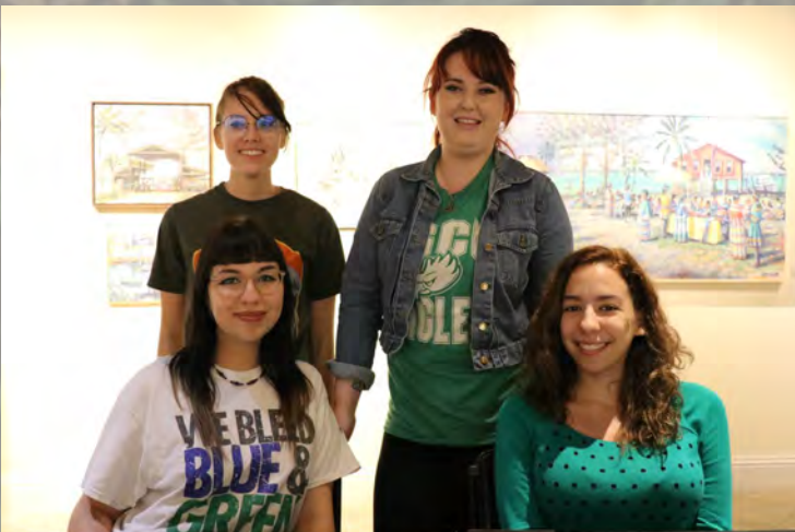
The Florida Gulf Coast University Museum Club were stationed in the Sandlin Gallery.