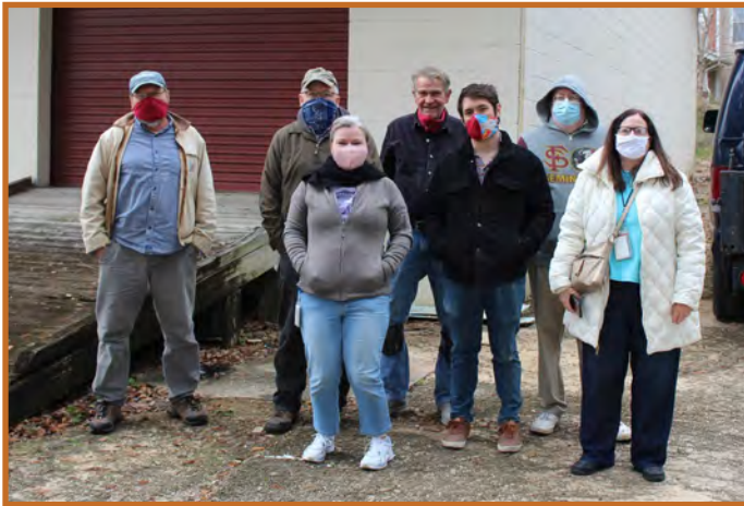
MFH staff ensured the safe transportation of the skiff.