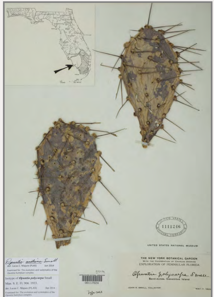
Above: Prickly pear cactus, Opuntia [ humifusa var. austrina ], Sand-dunes, "Caxambas Island," (May 11, 1922). Collected by J.K. Small.

Marco Island is home to more than 460 plant species, roughly 70% of which are native to Florida. Marco Island's flora is unique even compared to that of the nearby mainland. Certain species found on Marco Island are not found anywhere else in Collier County. One has been found only on