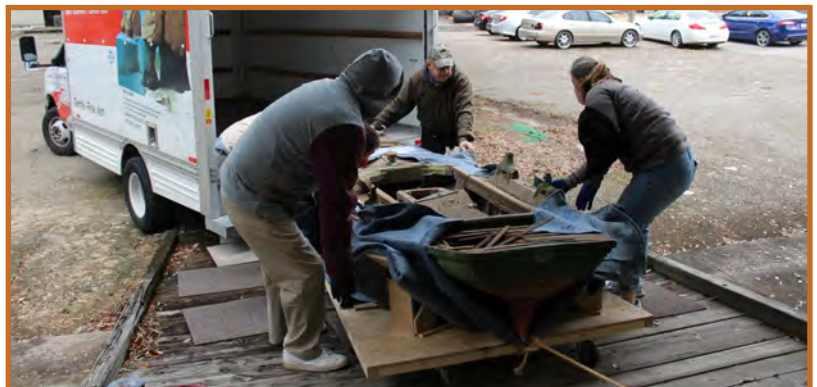
MFH staff loads the skiff into a truck in Tallahassee.