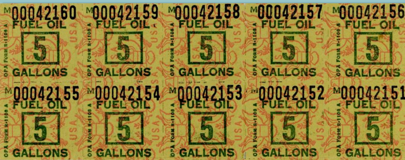
World War II Fuel Rations Identification Folder (top) and Stamps (bottom)