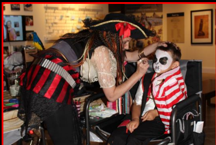
Face painting in the Sandlin Gallery.