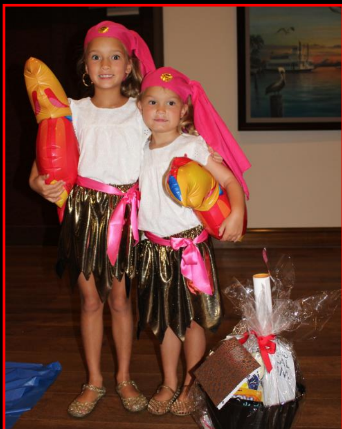
Costume contest winners.