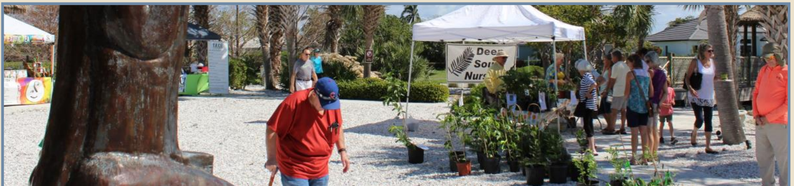
More than 600 people attended the MIHM's 2nd Annual "Pineapple Day."