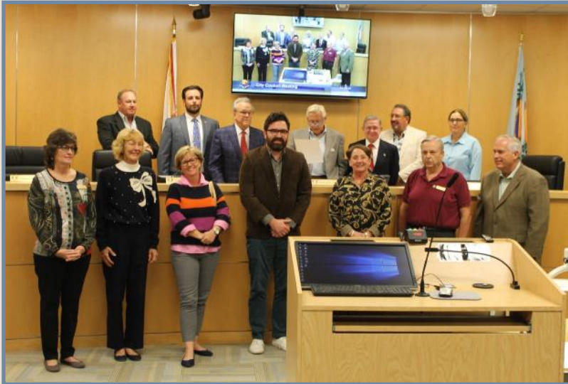
Representatives of the MIHS and the Collier County Museums receive a proclamation from the City of Marco Island on January 22, 2019.