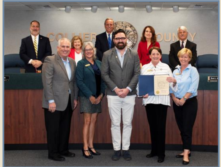
The MIHS and the Collier County Museums receive a proclamation from the Collier County Board of Commissioners on February 12, 2019.