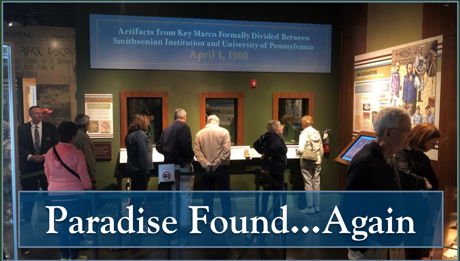
Above: Visitors to the revamped exhibit Paradise Found: 6,00 Years of People on Marco Island, now featuring the Key Marco Cat and other significant artifacts on loan from the University of Pennsylvania, on opening day (January 26, 2019).